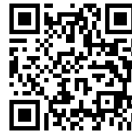
Image may differ from the actual product