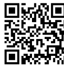
Image may differ from the actual product