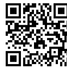
Image may differ from the actual product