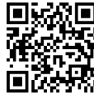
Image may differ from the actual product