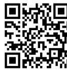
Image may differ from the actual product