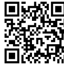
Image may differ from the actual product