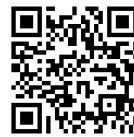
Image may differ from the actual product