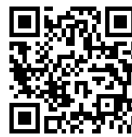
Image may differ from the actual product