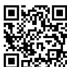
Image may differ from the actual product